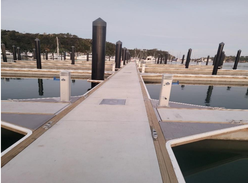
Left: completed L-Pier rebuild

This pier has now been completely rebuilt and the bridge is back in place. The power pedestals are being positioned and will be lived up once the plumbing has been completed. We will also supply new temporary ropes to all berths to enable boats to get back home in due course. Very positive progress!