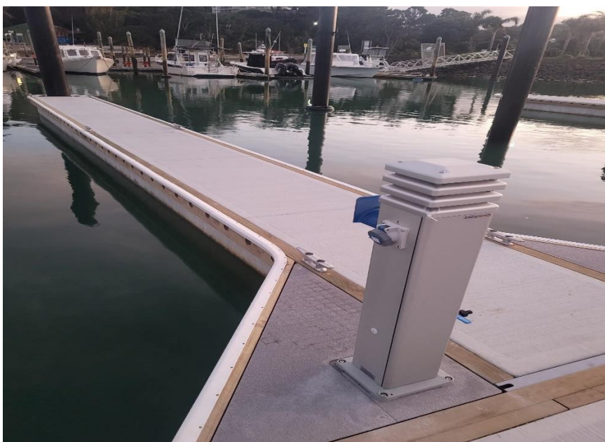
Left: New finger on L Pier